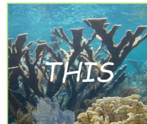
Healthy Coral Reef